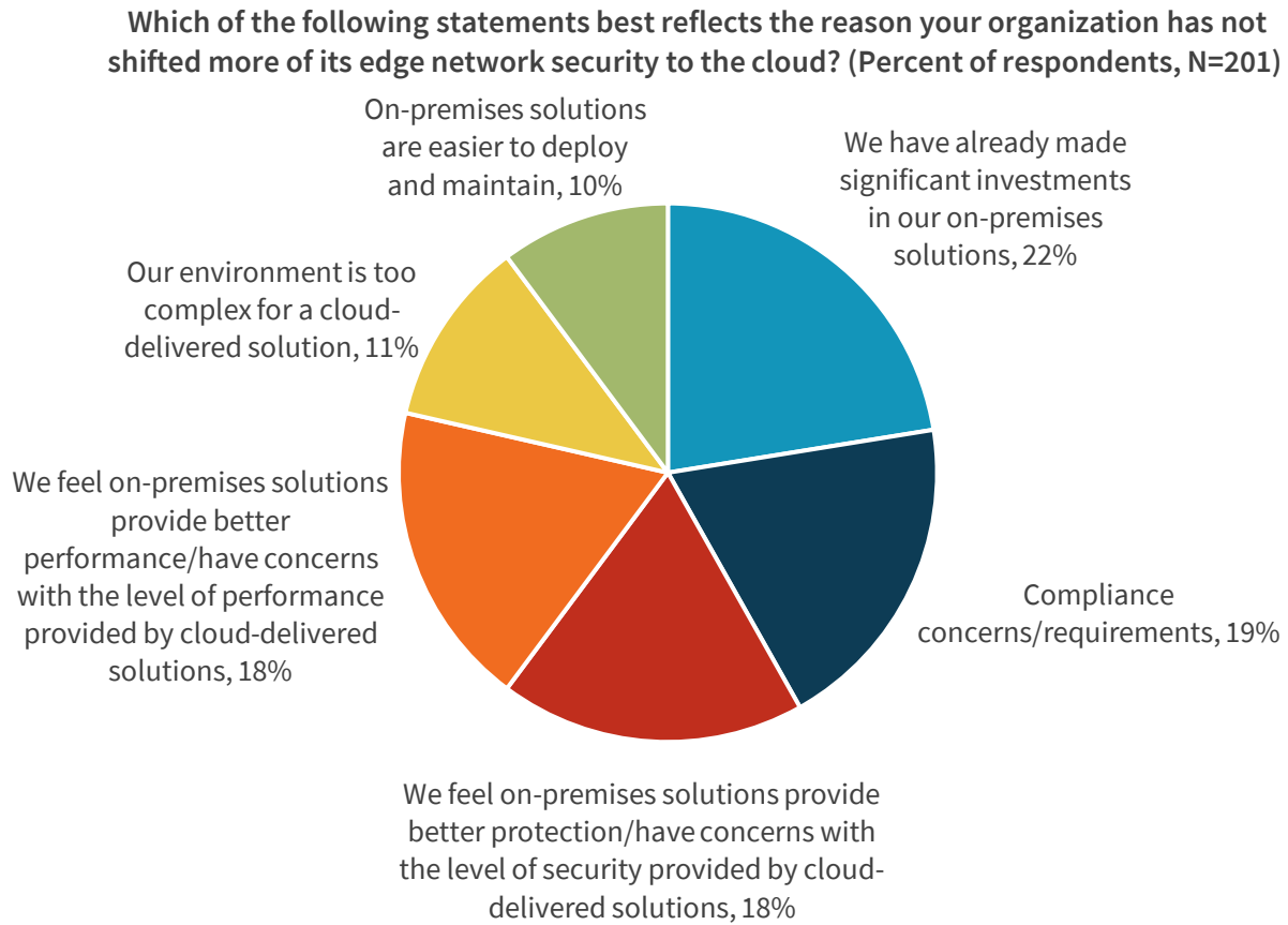
Figure 3. Reasons for Using On-premises Security Tools